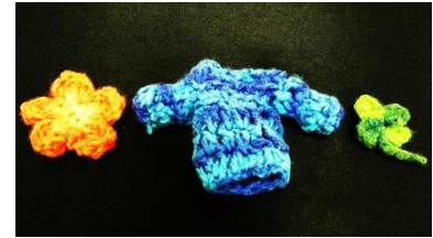
Figure 3. Examples of Crafts .