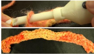
Figure 1. metamoCrochet .